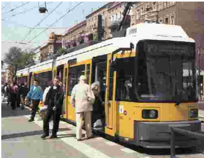
Berlin's modern low-floor trolleys, built by Adtranz, form the backbone of the city's surface transit system in the eastern part of this once divided city. Over 100 miles of tramway are in place—one of the world's most extensive LRT systems. Plans are under development to extend LRT to the western side of Berlin.

On the Back: Letter to the Editor, East Village "Walk and Talk" programs